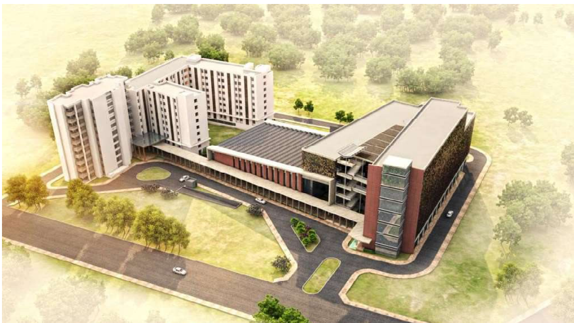
Artistic view of IIFT new campus, Maidan Garhi, New Delhi

In-charge, Executive Management Programmes Division INDIAN INSTITUTE OF FOREIGN TRADE B-21, IIFT Bhawan, Qutab Institutional Area, New Delhi-110016 Ph.: +91-11-39147320 (D) • +91-11-39147200 (Extn. 620) E-mail: empd@iiftedu Website: www.iiftac.in