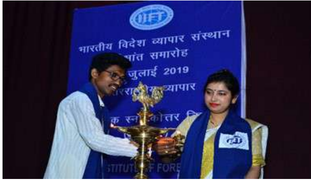
Lamp Lighting Ceremony by Participants