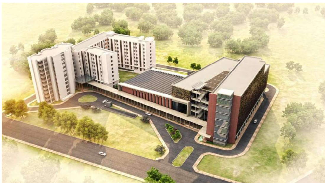
Artistic view of IIFT new campus, Maidan Garhi, New Delhi

In-charge, Executive Management Programmes Division INDIAN INSTITUTE OF FOREIGN TRADE B-21, IIFT Bhawan, Qutab Institutional Area, New Delhi-110016 Ph.: +91-11-39147320 / Mob.: 9560303707 E-mail: empd@iift.edu Website: www.iift.edu