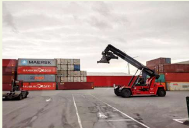
Port visit at Hamburg, Germany