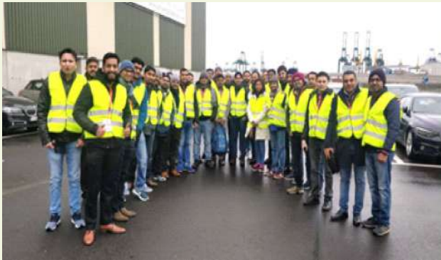
Port visit at Hamburg, Germany