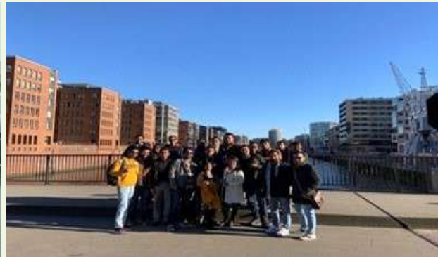
Participants enjoying sunny day at Belgium