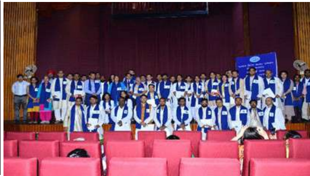
EPGDIB (Hybrid) Batch 2018-19