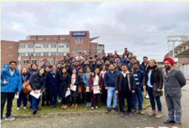
Participants at Airbus, Belgium