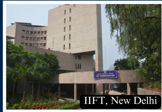
IIFT, New Delhi

To be an academic Centre of Excellence in international business research, training and education.